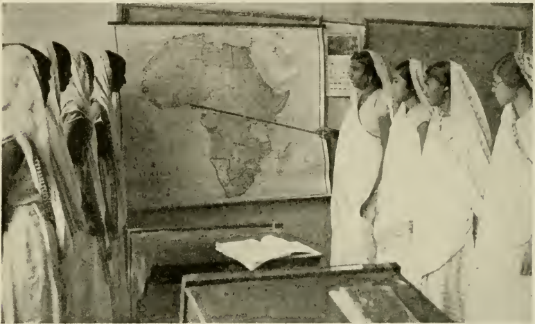
At Webb Memorial High School, Baroda, the students consider West Africa

A new scheme for education is being proposed by the Indian government.